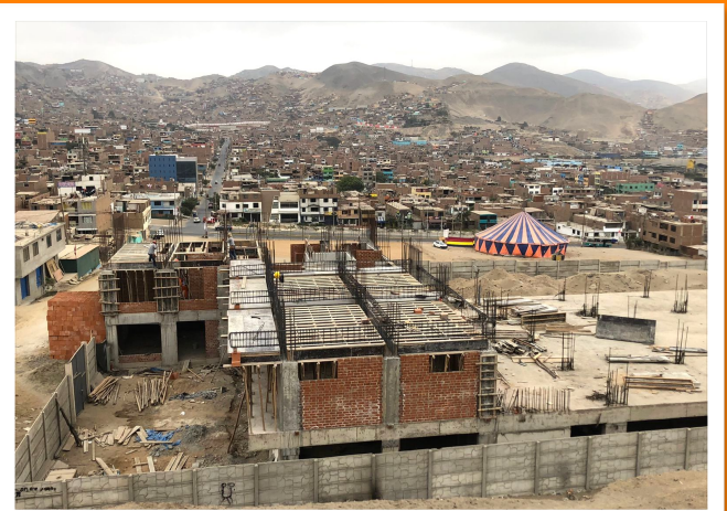
Construction progress (kindergarten)