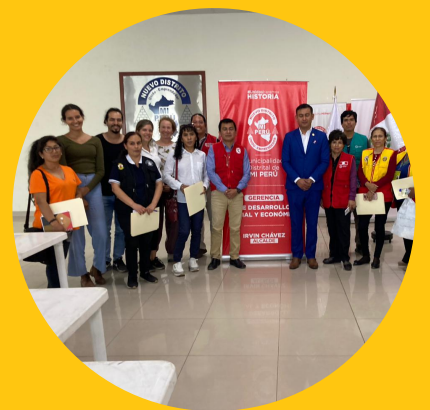
Meeting with Mayor "Round Table"