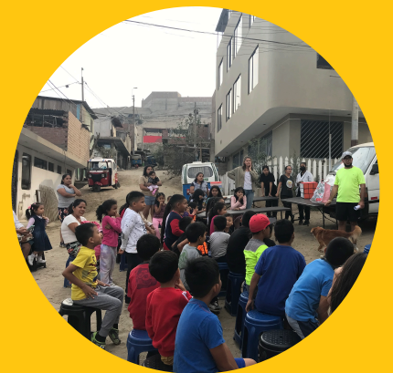
Children's program in Mi Peru (next to property)