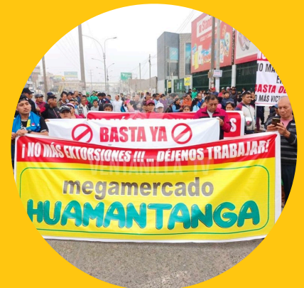
Demonstration against extortion mafias