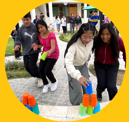
Games and sport at the youth weekend