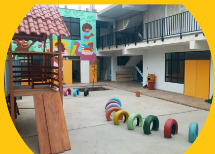
Kindergarten playground takes shape